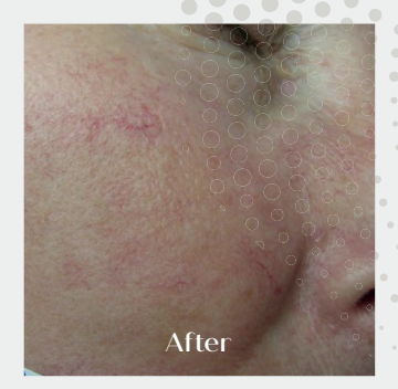
Vascular | Courtesy of Laser Skin Solutions