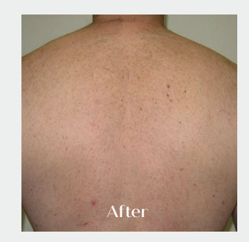
Hair Removal